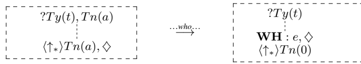
Figure 3: who-induced actions

a dative clitic cannot co-occur with a 1st/2nd person accusative clitic: